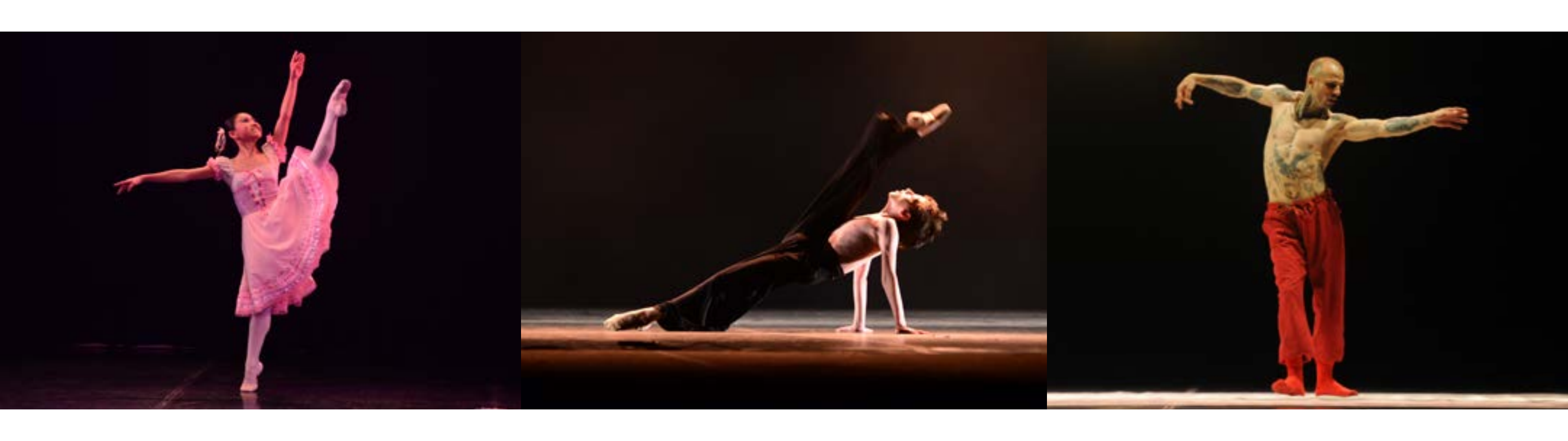
Born from 2011 to 2013