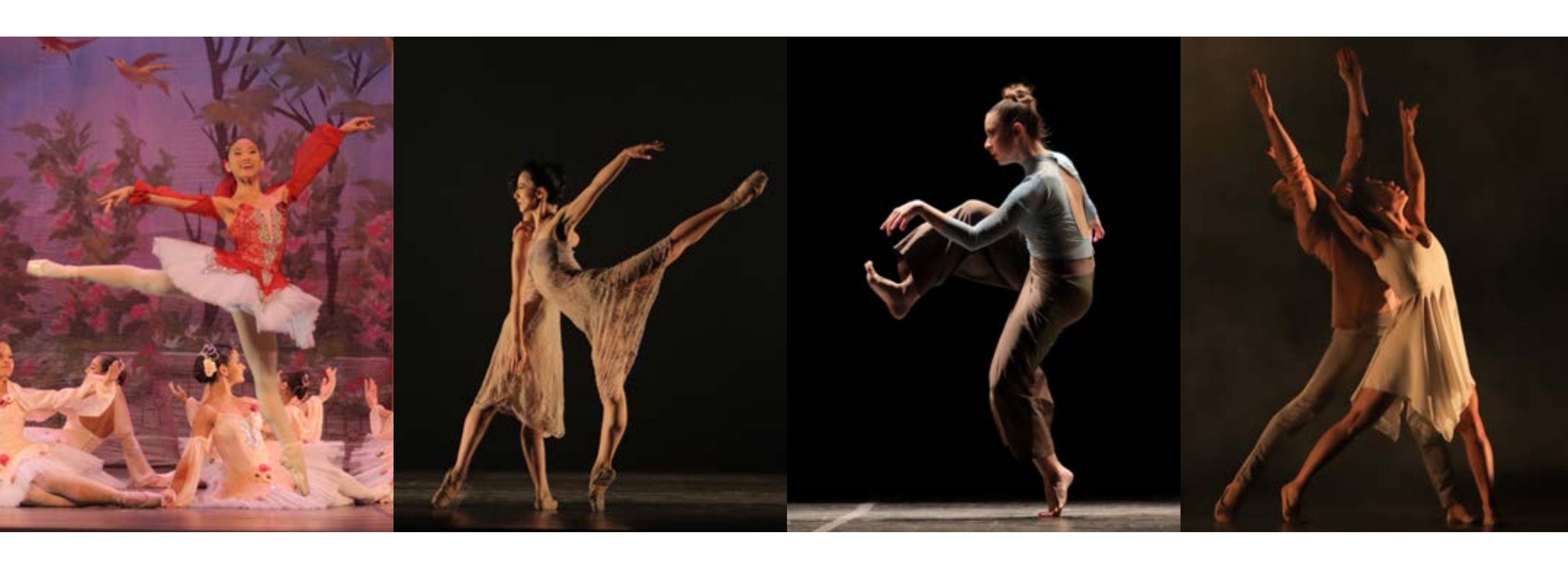
CLASSICAL BALLET REPERTOIRE